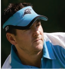
Ben Curtis - '00 Players Amateur Champion, '03 British Open, '06 Boozy Allen Classic & '06 84 Lumber Classic

Players Amateur alumni are making a name for themselves on the PGA TOUR. Here is a list of just a few that have won on TOUR.