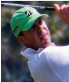
Matt Kuchar - '02 Honda Classic, '09 Turning Stone Resort Championship, '10 The Barclays